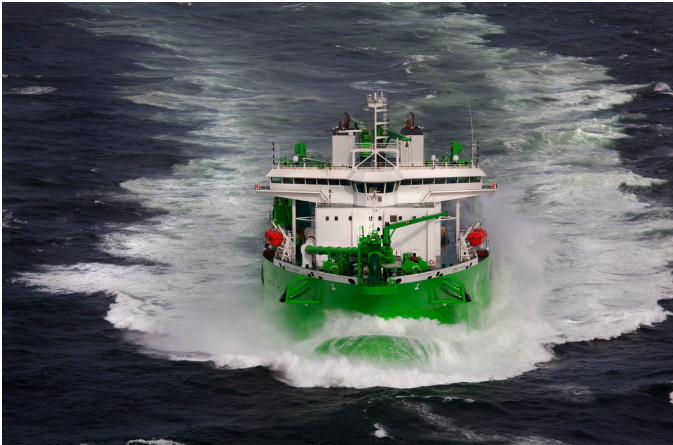
DEME's trailing suction hopper dredger 'Congo River'

Further in Nigeria , Nigerian Ports Authority awarded CTOW a towage license for Onne Port . The license secures towage operations to all port users and this for a period of 10 years. DEME is major shareholder in CTOW; co-owners are Multtraship and Herbosch Kiere.